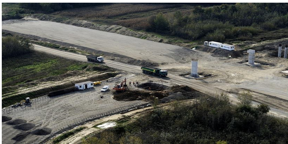
Construction works on the Mediterranean Corridor (CVC) in Bosnia and Herzegovina. The project has benefited from EU grant support in excess of €27 million, including a €25.09 million investment grant under the Connectivity Agenda in 2015.