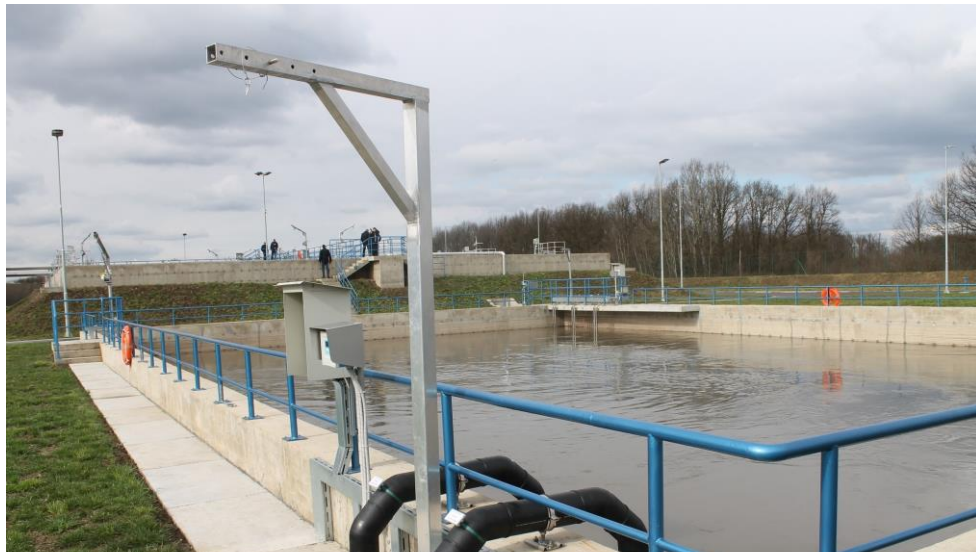
Wastewater treatment plant in Bijeljina. The EU has provided grants in excess of €9 million to cover project preparation and investment works

The EU has thus been instrumental in effecting key improvements in the everyday lives of the citizens in Bosnia and Herzegovina by: