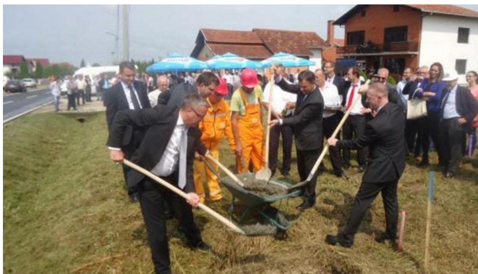
Laying the foundation stone of the Brcko bypass (September 2015). Works are ongoing. The EU has contributed a €0.5 million project implementation support grant.

In addition, Bosnia and Herzegovina has benefited from multi-country initiatives funded by the WBIF, such as the Regional Energy Efficiency Programme for the Western Balkans (REEP and REEP Plus), the Western Balkan Enterprise Development and Innovation Facility (EDIF) and the Regional Housing Programme.