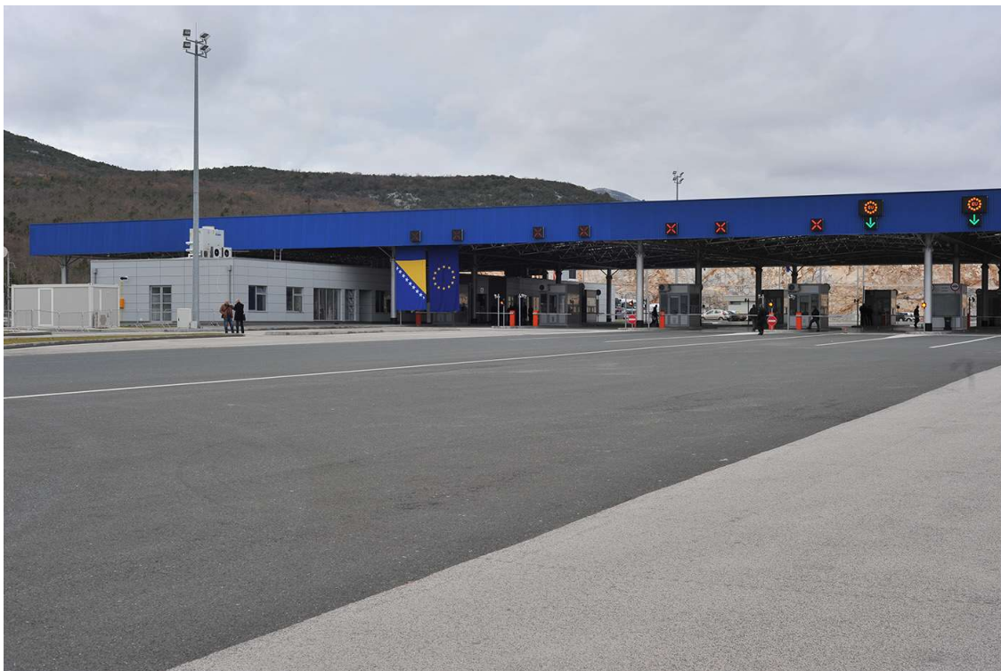
Border Crossing Bijača

“The introduction of ASYCUDA has simplified the procedures and it is considerably more effective than the previous solutions. We are very satisfied with the speed-up of the customs clearance procedure. The only minor issue is congestion of the main server which happens from time to time,” Antunovic said.