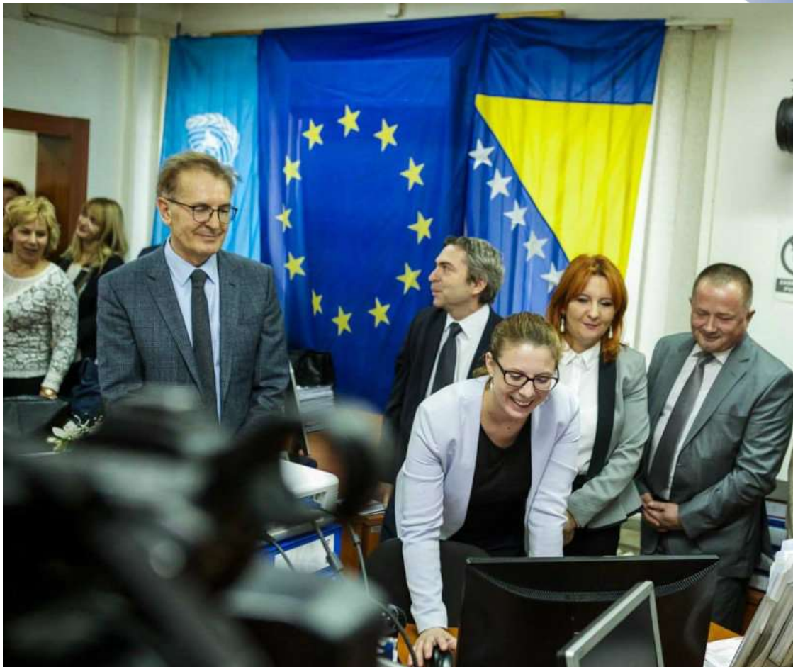
ASYCUDA++, was launched in November 2015 in Bosnia and Herzegovina

DELEGATION OF THE EUROPEAN UNION TO BOSNIA AND HERZEGOVINA