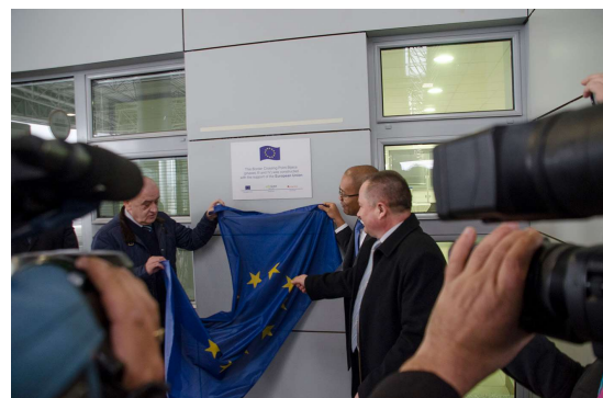
Approximately EUR 40 million has been allocated for construction and improvements of ten border crossings