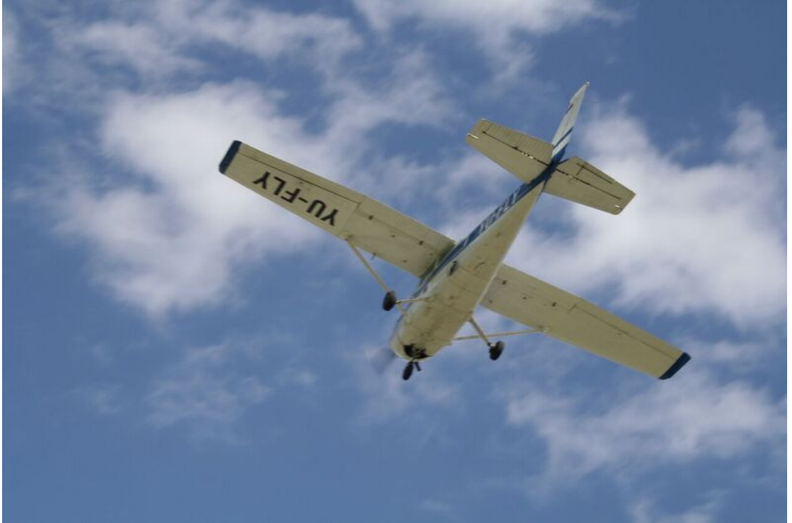
Spring 2017 oral vaccination campaign will be 12th in BiH financed by the EU

The control and eradication programme against rabies in BiH is part of a larger set of EU funded initiatives covering other IPA countries in the Balkans that began in 2011. Since then a total of 11 EU-funded campaigns of oral vaccination of red foxes have been implemented. The latest campaign was concluded in autumn 2016 and an additional one is planned for Spring 2017. In total, IPA funds have provided approximately EUR 8 M for vaccination campaigns and an additional EUR 1 M for technical assistance support for the coordination of animal disease programmes in BiH.