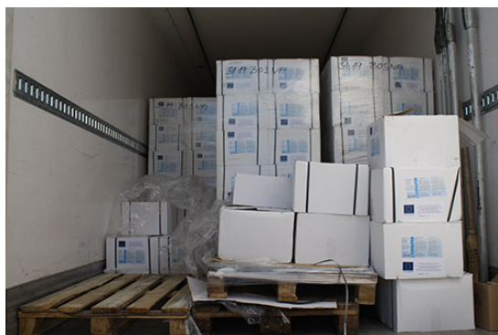
EU has provided approx. 8 MEUR for vaccination campaigns

What remains to be done is the implementation of the Ordinance on the identification of dogs, which will boost the size of the dog control group across Bosnia and Herzegovina, as well as the continuation of the passive control of the foxes via laboratory testing of those foxes found dead or killed on the road and of those that show unusual behaviour indicating the presence of rabies.