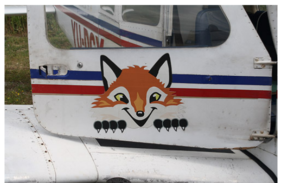
Oral vaccination campaign started in spring 2011

The vaccinations carried out by air distribution of the vaccine baits are part of the strategic programme of control and eradication of animal diseases, especially zoonoses, which are diseases common to people and animals, like rabies. It is coordinated and managed by the Veterinary Office of BiH, in cooperation with Entities and Brcko District's competent authorities. The oral vaccination of wildlife foresees the application of oral vaccination of foxes and other wild carnivores twice a year, in the fall and in Spring, in line with European and international standards. The long-term goal of the programme is the complete eradication of the disease in BiH and maintaining the status of a country free of rabies.