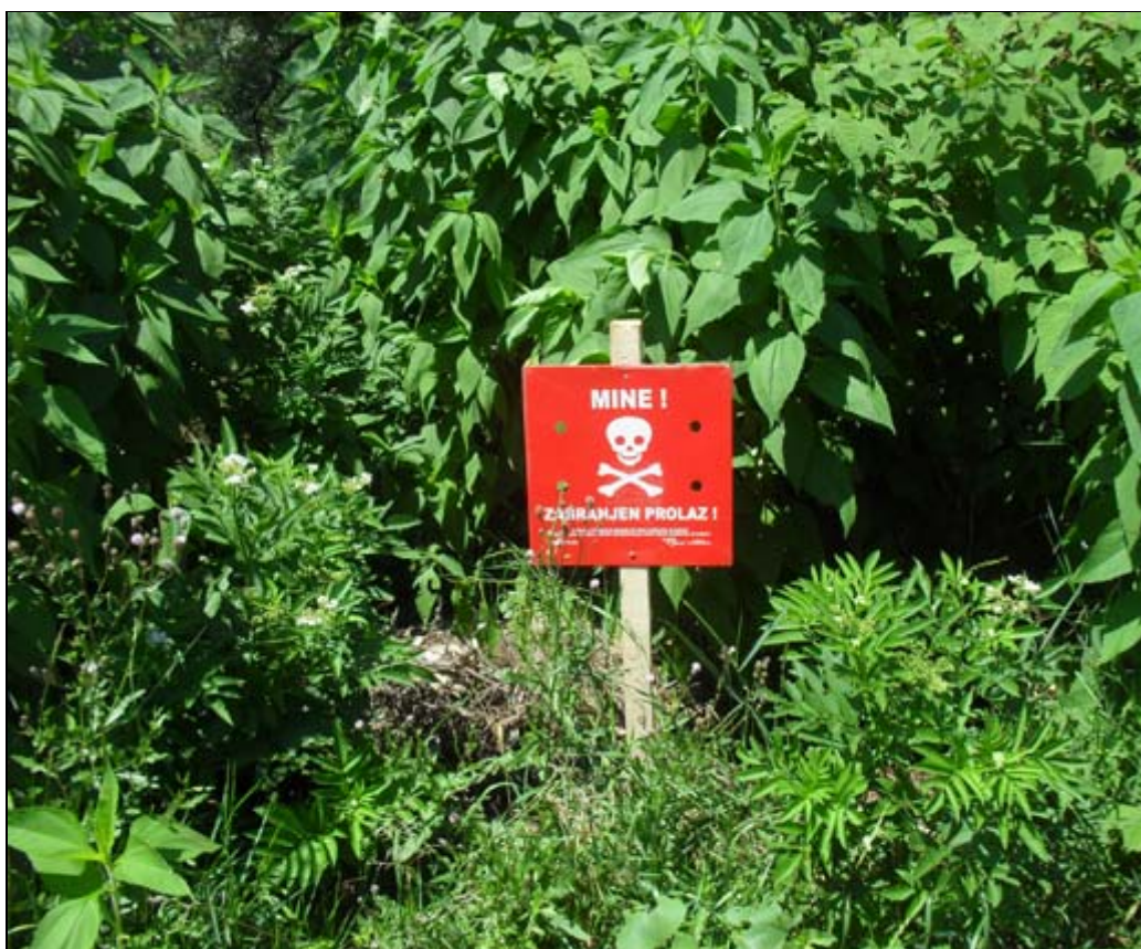
Photo taken from the point 6505771 4950029 under the angle of 271 degrees, direction marked on the map with an arrow.