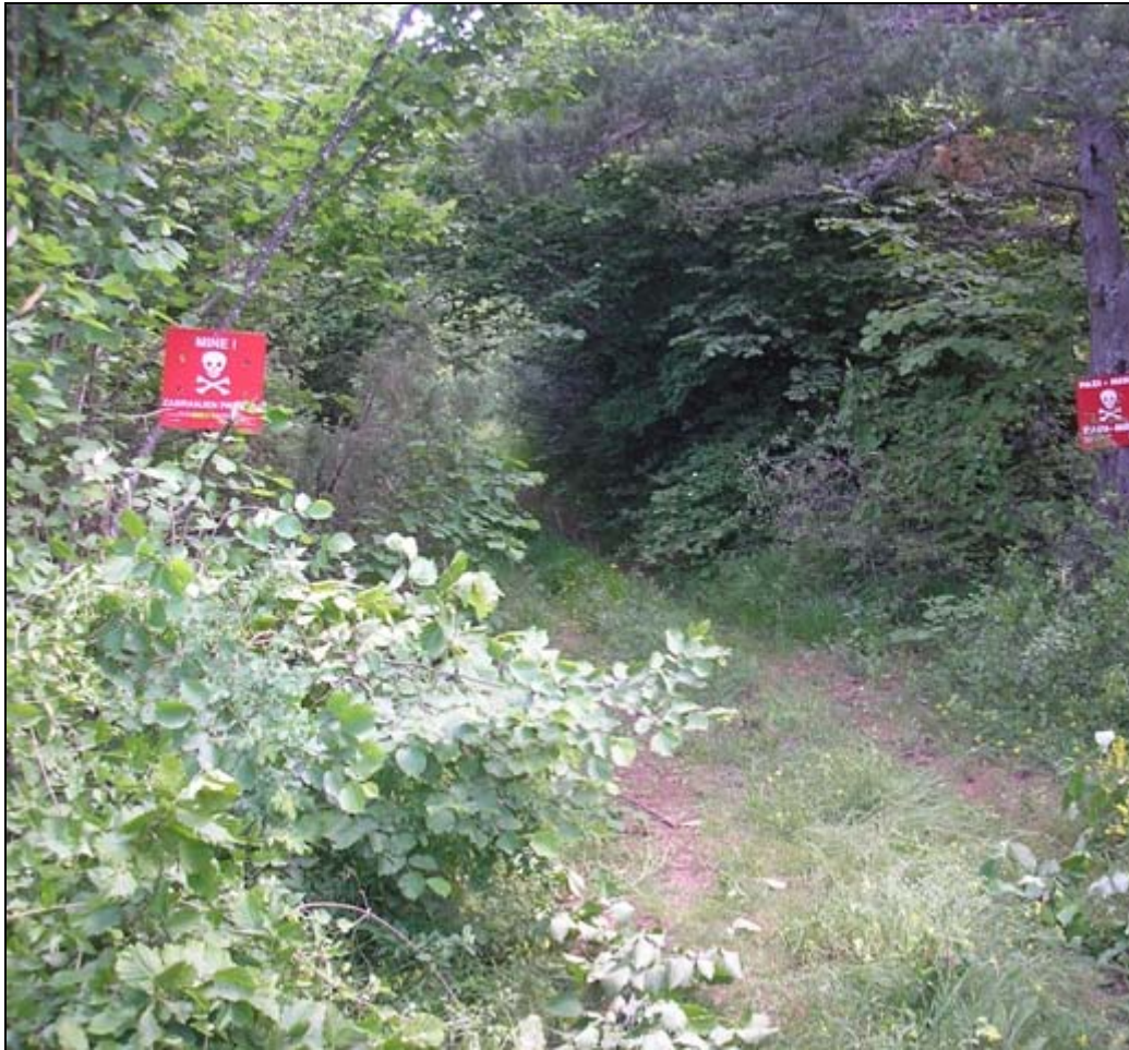
Photo taken from the point Y 6 448 520,00 X 4 885 361,00 at the angle of 35 degrees, direction marked on the map with an arrow.